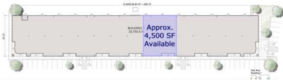
Site Plan Building 5 1" = 10'-0"