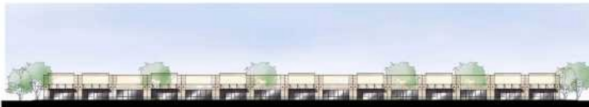
East Elevation Building 5 1" = 10'-0"